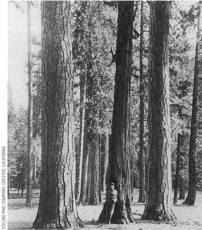
COLLINS PINE COMPANY, CHESTER, CALIFORNIA

Indeed, the timber cruiser was leaning on an incense cedar and not a sugar pine as the caption indicated. It is gratifying to know that so many of you are reading the magazine in detail and care enough to write. Both photographs are printed here for your viewing pleasure. Please keep the comments coming.