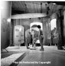
Image ID: FHS289th Image Date: [1964?] Image Title: Exhibits at the Cradle of Forestry in America.