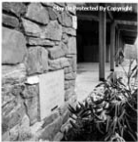
Image ID: FHS288th Image Date: [1964?] Image Title: Cornerstone at the Cradle of Forestry Visitor Information Center.