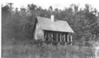
Image Title: Buildings -- North Carolina: Biltmore Forest, Transylvania County.