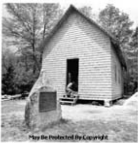
Image ID: FHS287th Image Date: [1964?] Image Title: The restored Biltmore Forest School.