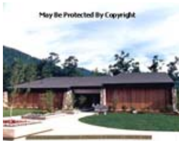
Image Title: New Era Celebration -- Cradle of Forestry in America -- June 25, 1988.