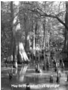
Image Caption: [Scenic shot of trees in swamp. Likely in the state of Louisiana.]