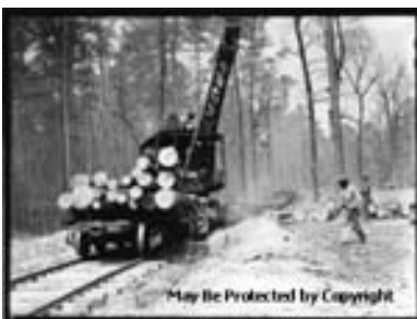
Image Caption: [Two unidentified African-American men working with a log loader in a pine forest. Likely a Urania Lumber Company operation in the state of Louisiana.]