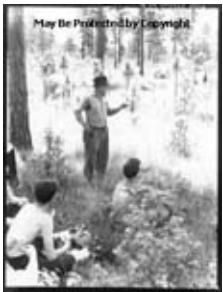
Image Caption: [An unidentified man presumably lecturing Yale forestry school students enjoying a meal in a forest populated with pine and oak trees. Likely during a 1938 school field trip to the state of Louisiana. For many years the school held a spring camp for its students on Urania Lumber Company land in Louisiana.]