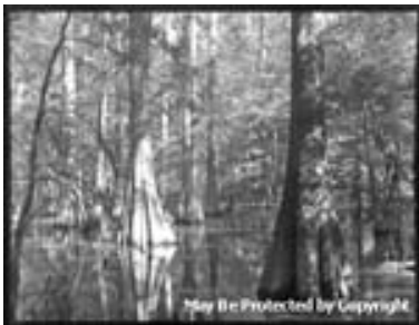
Image Caption: [Scenic view of trees in a swamp. Likely in Louisiana.]