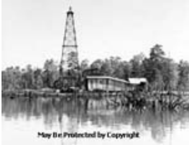
Image Caption: [View of a metal tower or derrick next to a wooden building at the edge of a forest, with an unidentified body of water in the foreground. Structures likely associated with the Urania Lumber Company of Louisiana.]