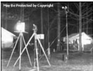
Image Caption: [An engineer's transit and plane table perched atop tripods in a clearing in front of a couple of tents. This equipment was likely used to conduct a forest survey, as the tents seem to be located in a forest clearing. Probably in the state of Louisiana.]