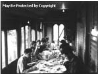
Image Caption: [A group of men, likely Yale forestry school students on a 1938 field trip to view Urania Lumber Company operations in Louisiana, enjoying a meal.]