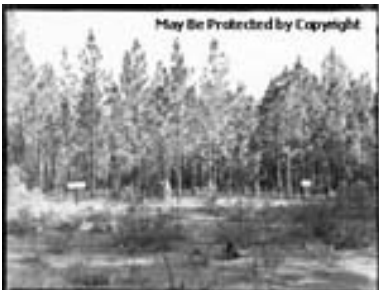
Image Caption: [A man visible in the middle distance looks through a level atop a tripod. A pine forest is behind him. In the foreground is what appears to be regenerating vegetation on an area that was previously cleared of trees. Likely in the state of Louisiana.]