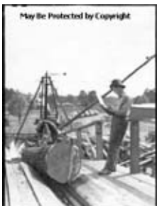
Image Caption: [One man oversees the power washing of logs being pulled by a bull chain from a log pile into a lumber mill or sawmill. Another man consulting papers affixed to a clipboard he is holding stands beyond the washing mechanism closer to where logs enter the mill. Possibly a mill run by the Urania Lumber Company of Louisiana. Train cars loaded with cut logs are visible in the distance.]