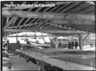
Image Caption: [Four men in the right distance look toward the camera. In front of them are pieces of lumber, apparently drying on a rack in a shed at a lumber yard likely owned by the Urania Lumber Company of Louisiana.]