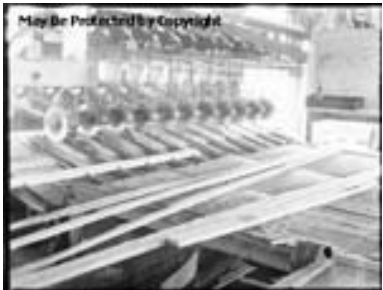
Image Caption: [Lumber passing through a trimmer saw -- a saw with multiple circular blades used to cut lengths of lumber into smaller pieces. Likely at a Urania Lumber Company mill in the state of Louisiana.]