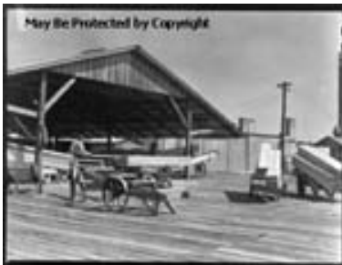
Image Caption: [Multiple wooden carts laden with boards of lumber stored at a shed in a lumber yard likely associated with the Urania Lumber Company of Louisiana.]