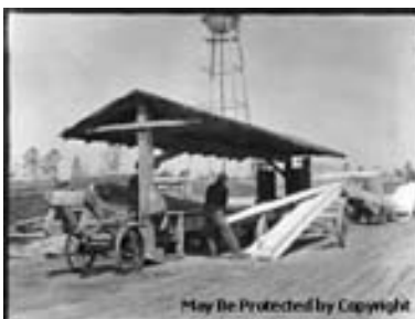
Image Caption: [View of man offloading lumber from a wooden cart. Numerous stacks of lumber are visible in the lumber yard behind him, and a water tower is in the near distance. Structures likely associated with the Urania Lumber Company of Louisiana.]