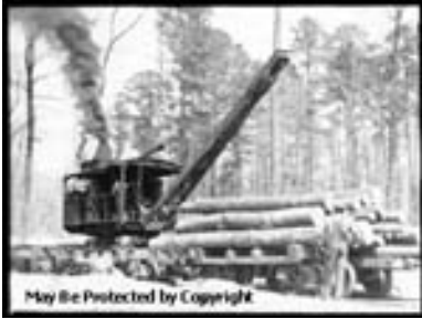
Image Caption: [Partial side view of log loader emitting black smoke from its stack. A railroad car bed stacked with logs perches immediately in front of it on railroad tracks. A man stands in the right foreground at the end of the loaded train car, and pine trees are visible in the distance. Likely a Urania Lumber Company operation in the state of Louisiana.]