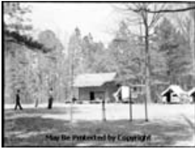
Image Caption: [Three unidentified individuals stand in a campsite with several tents and a log cabin. An automobile is parked to the left of the cabin. Likely Yale University forestry school students. For many years the forestry school at Yale held a spring camp for its students on Urania Lumber Company land in Louisiana.]