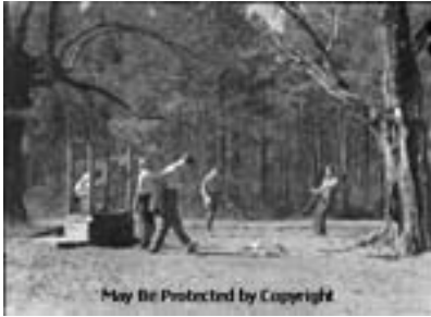
Image Caption: [Four unidentified men appear to be constructing or disassembling a wooden structure, perhaps a well or outhouse, in a forest clearing. Likely students from Yale University's forestry school, which annually conducted spring field work from a base camp on Urania Lumber Company land in Urania, Louisiana, for many years.]