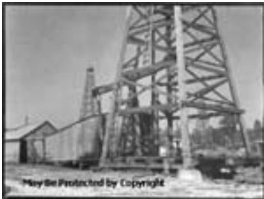
Image Caption: [Close-up view of wooden tower, or derrick, and wooden buildings at base. Two additional towers are visible in the background. Structures likely owned by the Urania Lumber Company of Louisiana.]