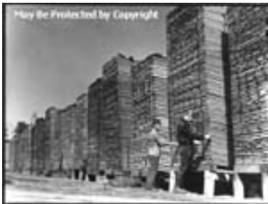
Image Caption: [Two men examine stacks of lumber in a lumber yard likely run by the Urania Lumber Company of Louisiana.]