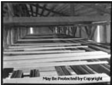
Image Caption: [Lumber on conveyor belts inside a building at a sawmill likely owned and operated by the Urania Lumber Company of Louisiana.]