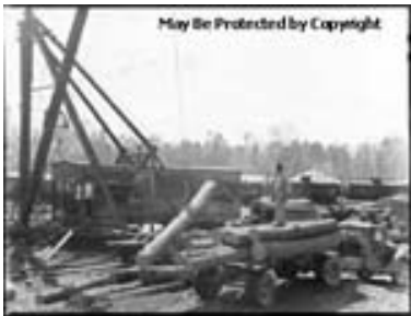
Image Caption: [A man standing atop a load of logs that have been placed on a truck bed watches as a log loader lifts a log from the back of the truck onto the ground. Piles of logs are visible around the loader, as are train cars behind it. Likely a Urania Lumber Company operation in the state of Louisiana.]