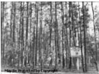
Image Caption: [Sign indicating a site where thinning operations have been conducted by the U. S. Forest Service's Southern Forest Experiment Station. The Urania Lumber Company of Louisiana is mentioned on the sign.]