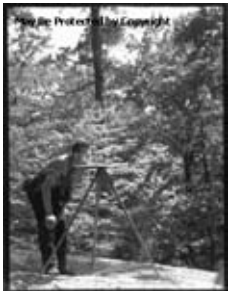
Image Caption: [An unidentified man sights across an engineer's plane table while conducting a survey in a forest. Likely a Yale University forestry school student conducting field training in Urania, Louisiana. For many years the forestry school at Yale held a spring camp for its students on Urania Lumber Company land in Louisiana. Part of the students' field work included studying survey techniques to determine how to lay out logging railroads, to cruise timber, to measure tree growth, and to construct topographic maps.]