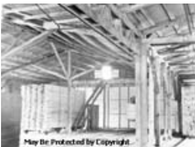
Image Caption: [Interior view of a building housing stacks of lumber on pallets. Structure likely associated with the Urania Lumber Company of Louisiana.]