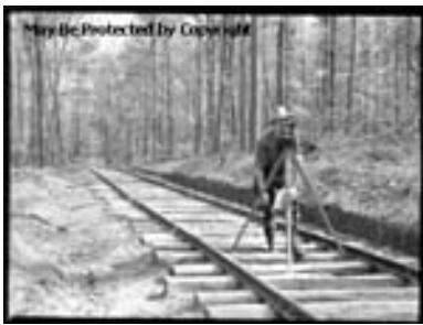
Image Caption: [An unidentified man looks through a level atop a tripod perched on railroad tracks in a forest. He is presumably doing forest survey work. Frontal view, with railroad track stretching back into the distance behind the man. Likely in the state of Louisiana. Likely a Yale University forestry school student conducting field training in Urania, Louisiana. For many years the forestry school at Yale held a spring camp for its students on Urania Lumber Company land in Louisiana. Part of the students' training included survey work used to design the layout of logging railroads.]