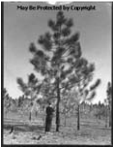
Image Caption: [Man inspecting the needles of a pine tree. Other pine trees are visible in the distance. Likely in the state of Louisiana.]