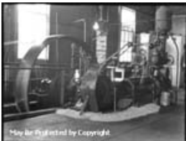
Image Caption: [Interior view of sawmill machinery likely owned and operated by the Urania Lumber Company of Louisiana.]