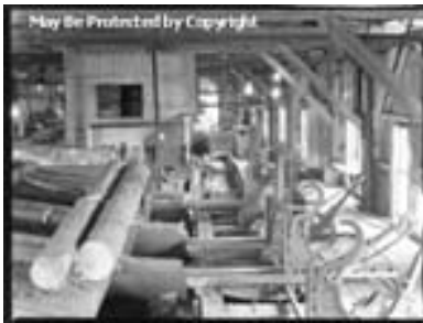
Image Caption: [Interior view of a sawmill showing two logs being processed by machinery. Sawmill likely run by the Urania Lumber Company of Louisiana.]