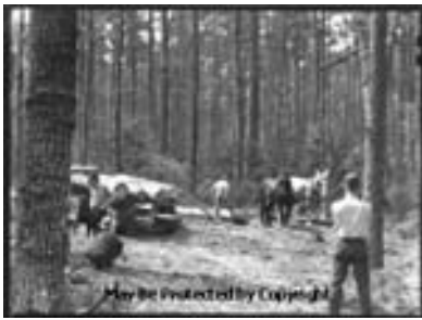
Image Caption: [Truck loaded with logs, mules, and men in a forest clearing. Likely a Urania Lumber Company operation in Louisiana.]