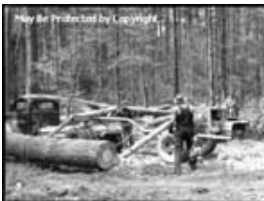
Image Caption: [Three men using a tractor with a chain attached to it to pull logs onto the back of a truck in a forest. Likely a Urania Lumber Company operation in the state of Louisiana.]