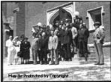
Image Caption: [A large, well-dressed group consisting mostly of men standing in front of an unidentified large brick building. The young men pictured are possibly Yale forestry school students while on a 1938 field trip to Louisiana.]