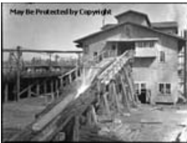
Image Caption: [Outside view of a lumber mill or sawmill possibly operated by the Urania Lumber Company of Louisiana. The image shows a bull chain pulling logs through a power wash mechanism up into a second-story entrance into a mill.]