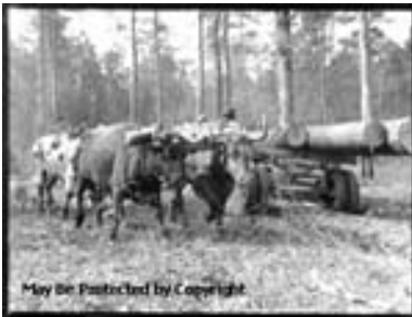
Image Caption: [A team of oxen stands next to a cart loaded with logs in a wooded area. Numerous men stand beyond the team and cart. Likely a Urania Lumber Company logging operation in Louisiana.]