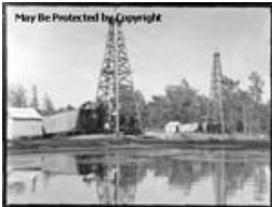
Image Caption: [Two towers, or derricks, at the edge of an unidentified body of water. Wooden buildings stand next to each tower. Structures likely owned by the Urania Lumber Company of Louisiana.]