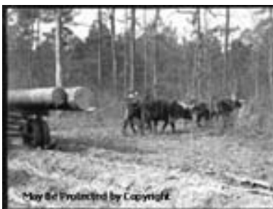
Image Caption: [Oxen and a cart loaded with logs they have recently pulled. Likely a Urania Lumber Company operation in the state of Louisiana.]