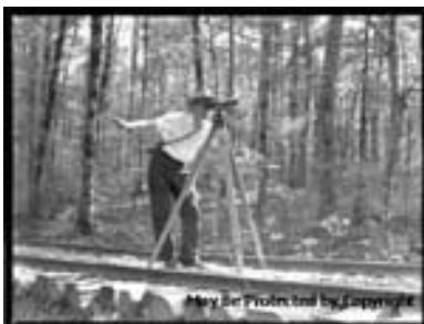
Image Caption: [An unidentified man uses a level perched atop a tripod on railroad tracks to presumably conduct a forest survey. Likely a Yale University forestry school student conducting field training in Urania, Louisiana. For many years the forestry school at Yale held a spring camp for its students on Urania Lumber Company land in Louisiana. Part of the students' training included survey work used to design the layout of logging railroads.]