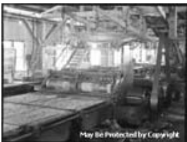
Image Caption: [Interior view of machinery used at a sawmill likely owned and operated by the Urania Lumber Company of Louisiana.]