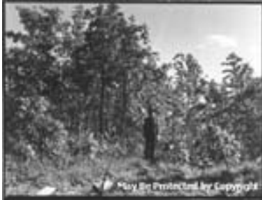
Image Caption: [View of a man wearing a hat in an oak forest. Likely in the state of Louisiana.]