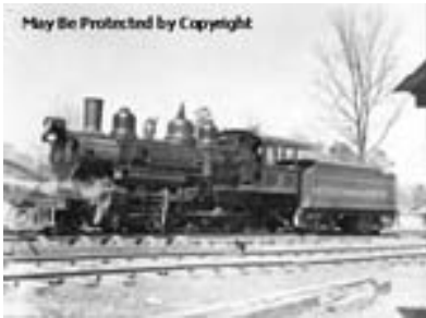
Image Caption: [Locomotive engine number 3. "Natchez Urania & Ruston" appears on side of engine car. Presumably a railroad that transported logs for the Urania Lumber Company of Louisiana.]