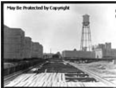
Image Caption: [A water tower, stacks of lumber, and boards drying on a rack in a lumber yard likely operated by the Urania Lumber Company of Louisiana.]