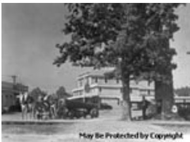
Image Caption: [View of a team of white mules pulling a wheeled cart loaded with a large log. A man is riding one of the mules. The image shows a dirt street in an unidentified town probably located in the state of Louisiana. A large three-story wooden building appears in the distance across the street; a large tree is shown in the foreground; and to the right of the tree stands a man next to a tall tree stump that has been hollowed out. A door has been cut into the side of the stump, and the man standing next to the stump is holding the door open.]