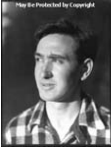
Image Caption: [Unidentified man, probably a forester, wearing a plaid shirt.]