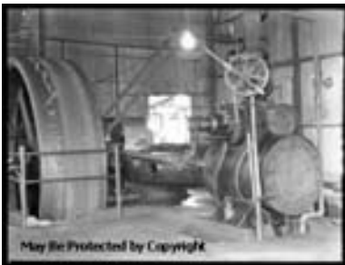
Image Caption: [Interior view of sawmill showing milling machinery. Sawmill likely owned and operated by the Urania Lumber Company of Louisiana.]