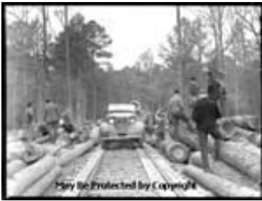
Image Caption: [Several men, possibly Yale forestry school students, observe a man wearing overalls who is using a stick as a lever to pry large logs off the bed of a truck parked on railroad tracks in a forest. Numerous logs lay on the ground to either side of the tracks' rails, and pine trees line the sides of the railroad in the background. Likely a Urania Lumber Company operation in the state of Louisiana.]