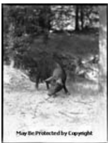
Image Caption: [Close-up view of possibly feral pig. Trees are visible behind the animal. Likely in the state of Louisiana.]