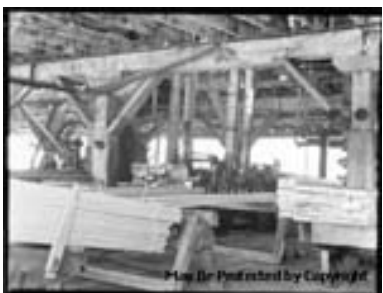
Image Caption: [Interior view of sawmill showing stacks of lumber. Sawmill likely owned and operated by the Urania Lumber Company of Louisiana.]