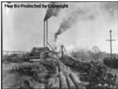
Image Caption: [Exterior view of sawmill presumably owned and operated by the Urania Lumber Company of Louisiana. Logs piled onto flatbed railroad cars are visible in the foreground, and a monorail system used for lumber transport is visible in the far left background.]