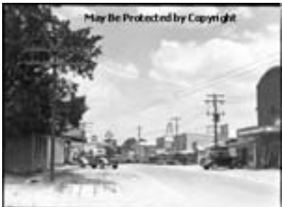
Image Caption: [Small stores and billboards line this unidentified street. Trucks and cars of the 1930s era are parked along either side of the dirt road. Possibly the town of Urania, Louisiana -- home of Urania Lumber Company.]