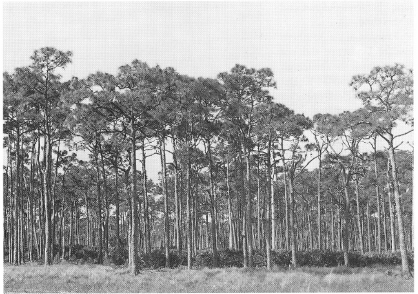
“Natural” stand of southern pine.

Trees adapted to these conditions where they survived long enough. In the South there are three serotinous-cone pines (the pond, table mountain, and sand pines) whose cones remain closed until fire opens them and prepares the site for the successful establishment of these light-demanding trees. Another fire-adapted species is longleaf pine. This stately flagship of the southern pinery once occupied approximately 90 million acres in the southern coastal plain. Today it is relegated to