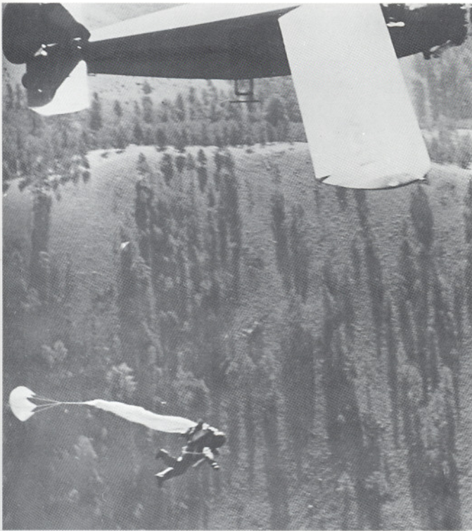
Smokejumper soon after leaving the plane, above the Lolo National Forest in Montana. The parachute is completely distended and the 30-ft canopy is unfolding.

going up in flames, meant keeping firefighting costs down, and made firefighting safer for everybody.