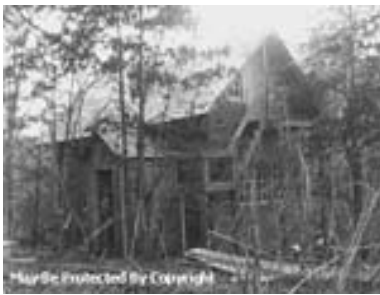
Image ID: FHS248th Image Date: [no date] Image Title: [Biltmore Forest School clubhouse.]

Thumbnail digital representations of images depicting people, places, and structures associated with the Biltmore Forest School are presented below along with brief descriptive information. The [Digital Surrogate] links to a larger digital image with more complete cataloging information associated with each photograph.